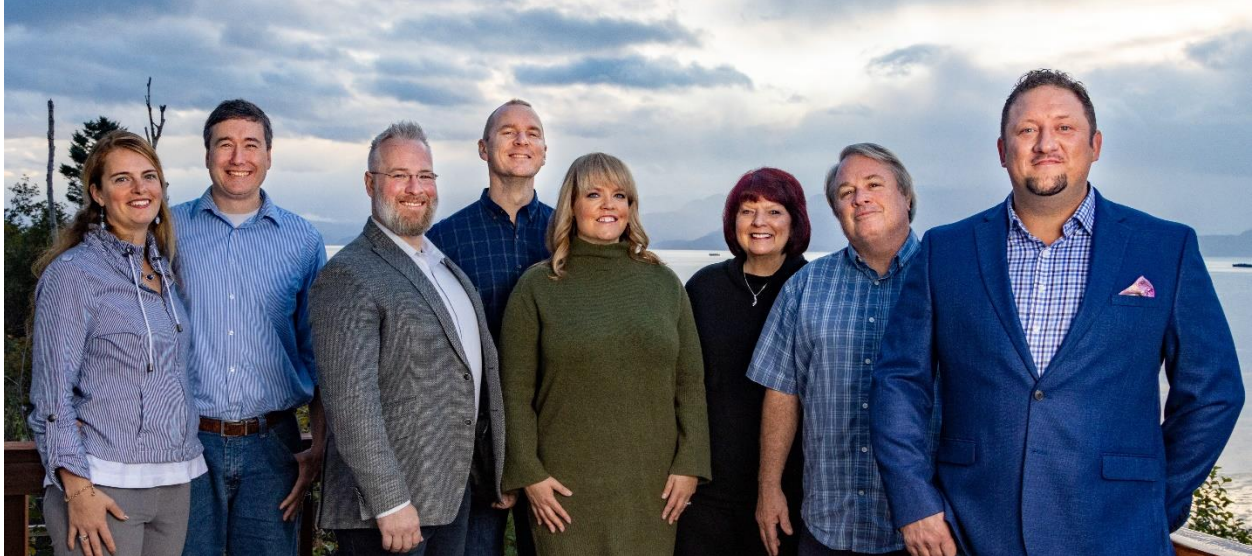
Set Free Alaska Board of Directors October 2020